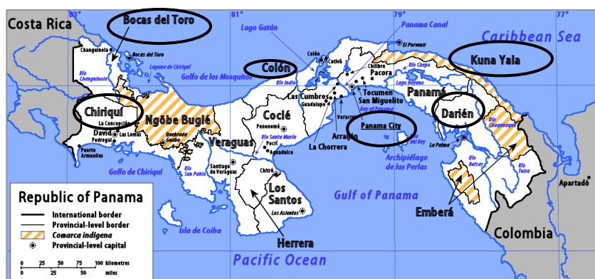
Fig. 3.2 Panama national territory

One group that quickly gained many adherents and still forms one of the larger churches in Panama, is the Seventh Day Adventists. This American denomination established their headquarters in Bocas del Toro in 1901 where they planted three churches and four missions. 27 Six years later they founded a church among the West Indians in the Canal Zone. Following the Protestant Episcopalians, several schools were opened in both the Canal Zone and Chiriquí. Initially they ministered mainly among the West Indians, but later extended their activities to the various Amerindian groups in Panama. It was in the thirties that they planted a church with the Guaymí in Chiriquí and among the Kuna Indians on the San Blas Islands and Chocó in the Darien region in the sixties. Interestingly, a decade later the membership of Hispanics increased rapidly from 40 percent to 60 percent, eventually outnumbering the West Indians and Amerindians (op. cit.: 25-27). Other groups coming to Panama in the last days of Colombian governance were Baptists from Jamaica in 1890 and the Jehovah's Witnesses arriving in 1900 (Moreno, 1983: 88, 109).